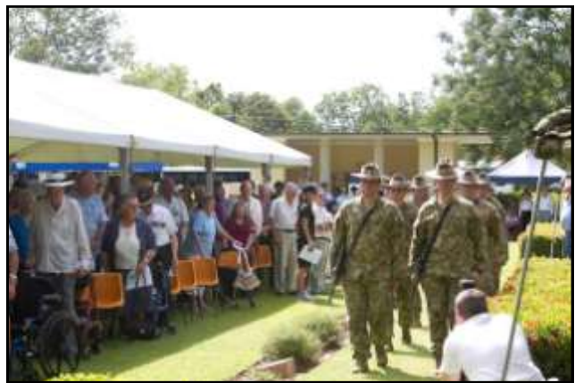
Norforce Catafalque Party march in.

The 70th Bombing of Darwin Service at the Adelaide River War Graves was an extraordinary occasion. People from the Coomalie community worked together with the Darwin City Council to create a moving service which was greatly appreciated by the WWII Veterans and their carers. They left feeling content in knowing that their mates lay at peace in such a beautiful environment. Thankyou to everyone who made the event such a success.