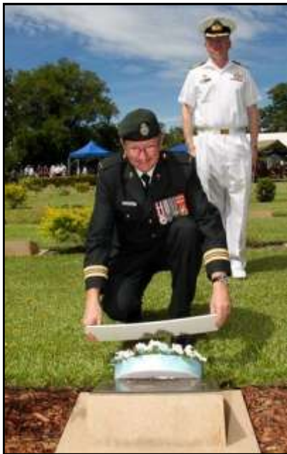
A Canadian Officer pays his respects to the sole Canadian who rests at the War Graves.